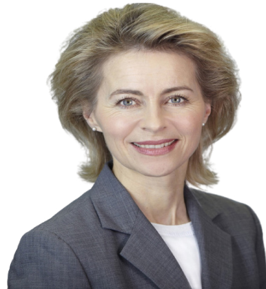
URSULA VON DER LEYEN HEAD OF THE EUROPEAN COMMISSION

In the quarter century I spent in the industry, I witnessed different phases and development processes of the industry. UTİKAD has always been and will continue to be the right address for the sector to move forward, develop and ensure global integration.